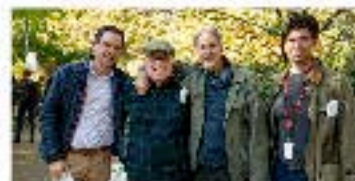
Native Son's Home 'Run'