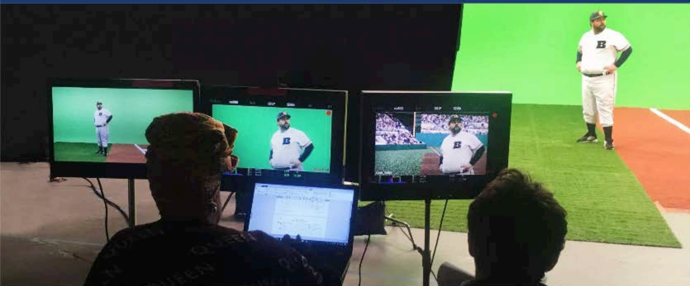
A turnkey production facility and virtual set campus, Cobalt Stages brings Hollywood to the Hudson.