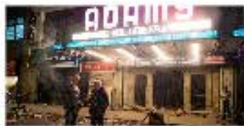
Building an Industry