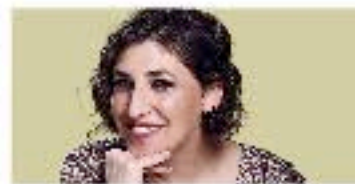
Discovering New Jersey