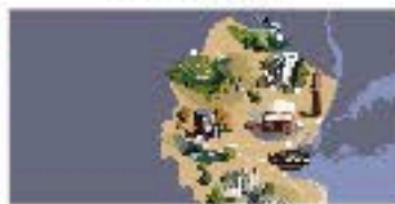
Taking the Scenic Route